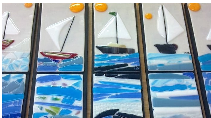
Glass fused boats. Projects will vary each session.